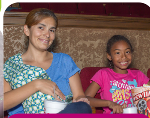
More Children's Activities PAGES 17-21