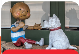
Storybook Sculptures PAGES 5-13