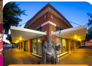
National Center for Children's Illustrated Literature PAGE 22