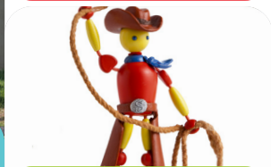
Seymour Passport Project PAGE 15