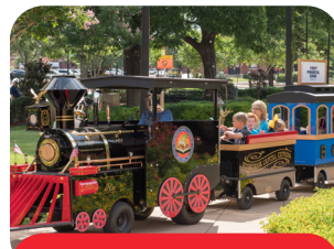
Children's Art + Literacy Festival PAGE 23