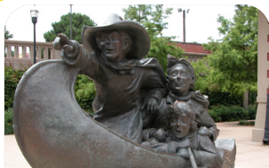
Storybook Sculpture Project PAGE 3