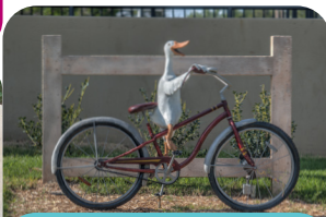
Storybook Audio Tour PAGE 15